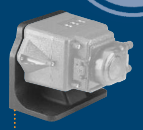
Stand EC304 For horizontal display or wall mount