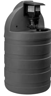
30-Gallon (113.6 Liters)