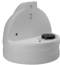
7.5-Gallon (28.4 Liters)