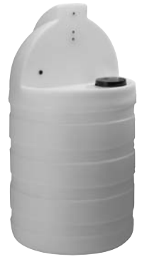
30-Gallon (113.6 Liters)