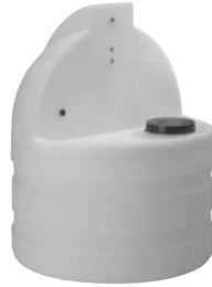
15-Gallon (56.8 Liters)