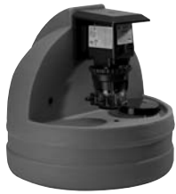
7.5-Gallon (28.4 Liters)