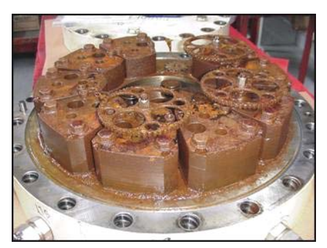
20333 Type 1 Frame 9FA Flow Divider