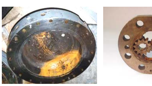
Corrosion caused by water in fuel from leaky check valves

can guickly consume the small clearances between the gears and housings and prevent rotation of the flow divider. This is the most common cause of flow divider failure in applications where dual-fuel turbines are run on natural gas for extended periods of time without regard for proper preservation measures. During operation on natural gas, the liquid fuel system is non-operational and the flow divider often remains filled with a stagnant volume of distillate fuel. Under those conditions, rust can quickly form on the surfaces of the housings that surround the gears, growing in volume until it prevents rotation of the flow divider. This condition can go unnoticed until a subsequent transfer from gas to liquid fuel operation is attempted. At that point, if the flow divider cannot break away, the turbine will trip due to a loss of fuel flow.