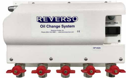
5-Valve Manifold System

Portable systems offer the same efficient maintenance in a convenient, easy-to-operate unit. Multiple generators/engines can be serviced by one pump, and it is an alternative option to an installed pump when space is limited. The system eliminates slow and potentially messy hand pump operations and operates on 12 or 24 volt power (battery clips included).