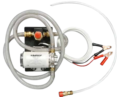
Portable System for Outboard Engines