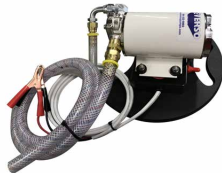
Portable System sits on lid of a 5-Gallon Bucket