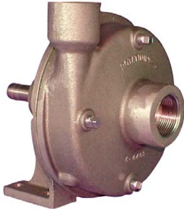
MODEL 800B BRONZE