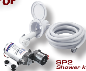
SP2 Shower kit Part Number 164 900 15