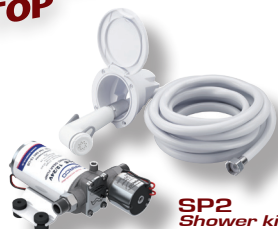
SP2 Shower kit Part Number 164 900 15