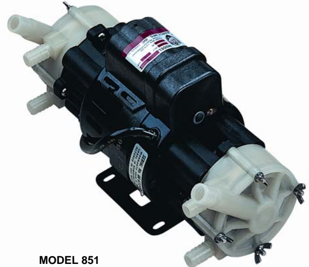
MODEL 851 ASS'Y NO. 0851-0001-0100