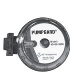
Pumpgard™ Inline Strainer