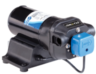
5.0 Water Pressure Pump