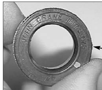
This side mates against the impeller.