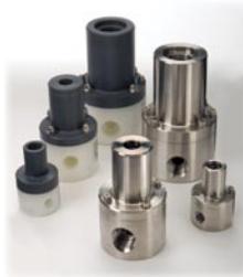
Pressure Relief and Back Pressure Valves