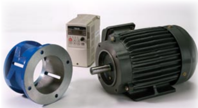
Motors, Motor Adapters, VFDs