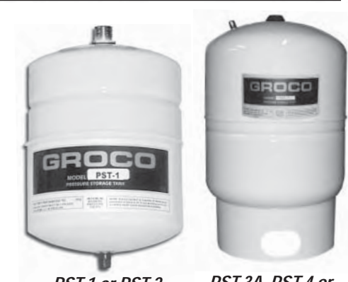
PST-1 or PST-2 PST-3A, PST-4 or PST-5

Check the PST air charge (with no water pressure present) at least monthly.