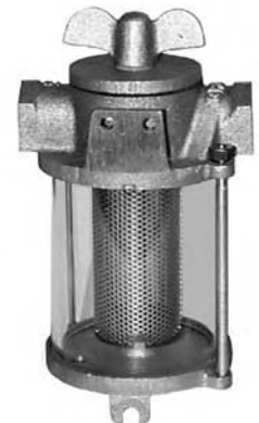
SA Series has a Lucite Sight Glass