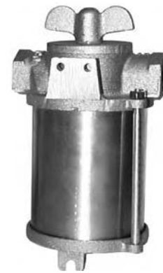
ASA Series has a #316 Stainless Steel Enclosure

Double clamp all hose connections and use TFE thread tape on threaded connections.