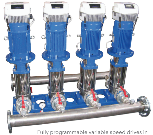
Fully programmable variable speed drives in space saving pump-mounted design

The HYDROVAR controller is a combination of a variable frequency drive and a programmable logic controller (PLC) in one compact package, is mounted on the fan cover of a TEFC motor. Drives are pre-programmed with patented pump specific software, designed for centrifugal pumps. They match pump output to a wide range of system conditions while protecting the pump, the motor and the pumping system.