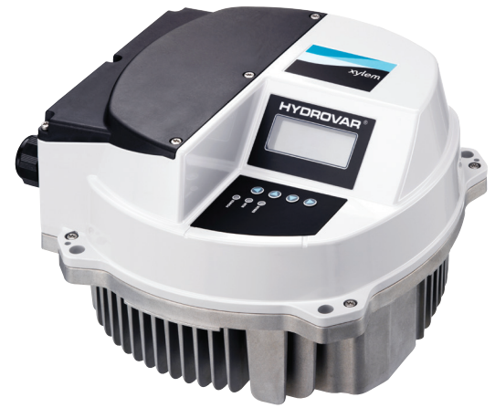
Pump Mounted Variable Speed Controller