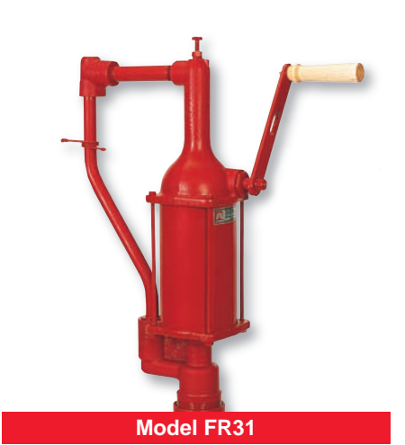
Quart and Liter Stroke Pump Series 30