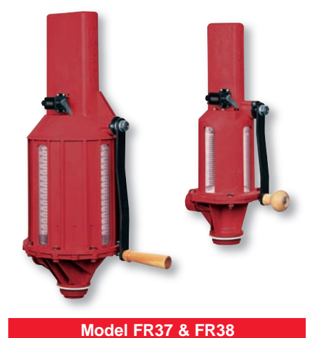
Gallon or Quart Volumetric Hand Pump Series 30