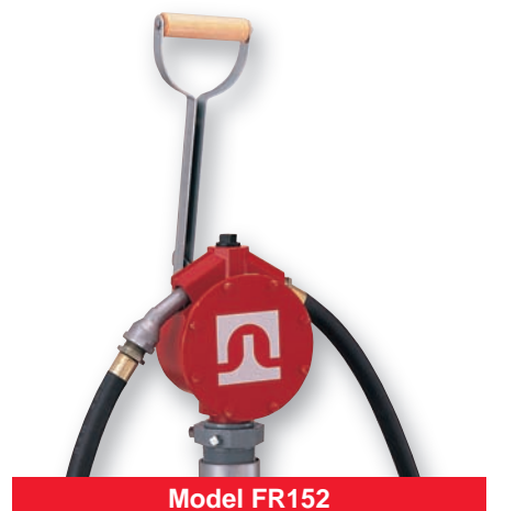
Piston Hand Pump Series 5200

Manufacturer of Quality: Hand Pumps • DC/AC Fuel Pumps • Flow Meters • Cabinet Pumps