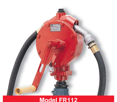
Rotary Hand Pump Series 100