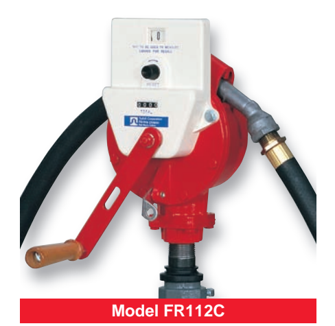
Rotary Hand Pump with Counter Series 100