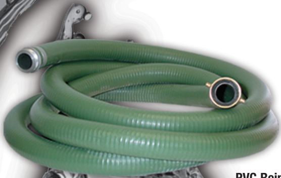
PVC Reinforced Suction Hose