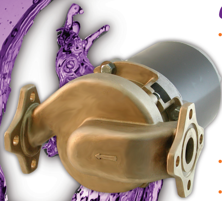
Bronze Circulator Pump

AMT Inline Circulator Pumps are designed for continuous duty industrial/ commercial systems. Pumps are available in a variety of material configurations to meet your specifications. All models are powered by a single phase 115 VAC ODP 56J NEMA frame 1/4 HP electric motor with 1/2-14 NPSM conduit connection. Direct coupled design eliminates stub shaft, oiled bearing and coupling, reducing maintenance. Pumps are interchangeable with other manufacturers, see cross reference on specification page.