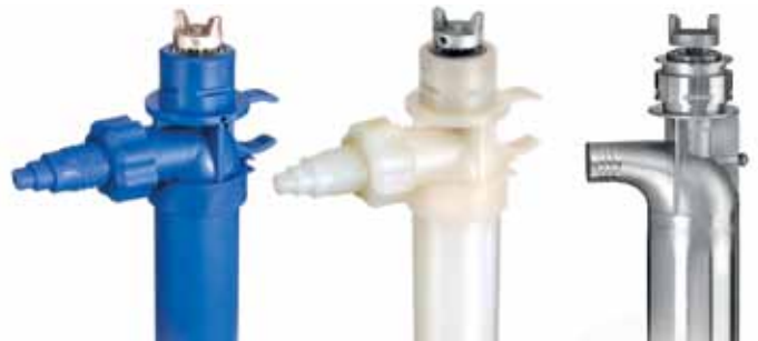
PF Series Drum Pump Tubes

Check out our other pump accessories at www.finishthompson.com/products/pump-accessories .